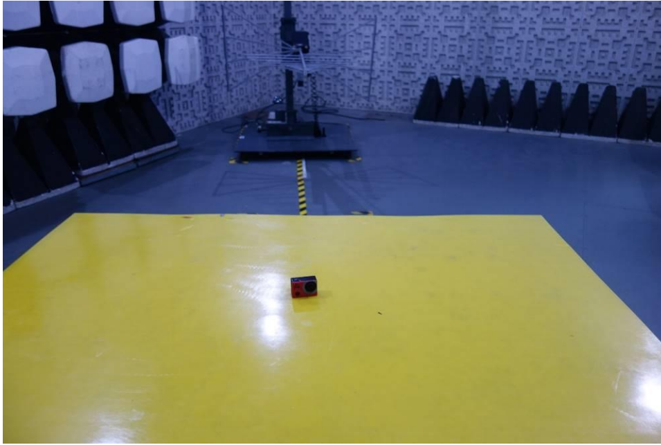
Radiated Spurious Emissions Above 1GHz