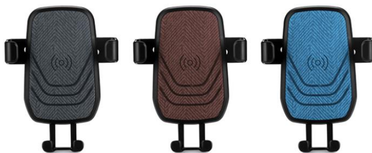
Wireless car charger holder