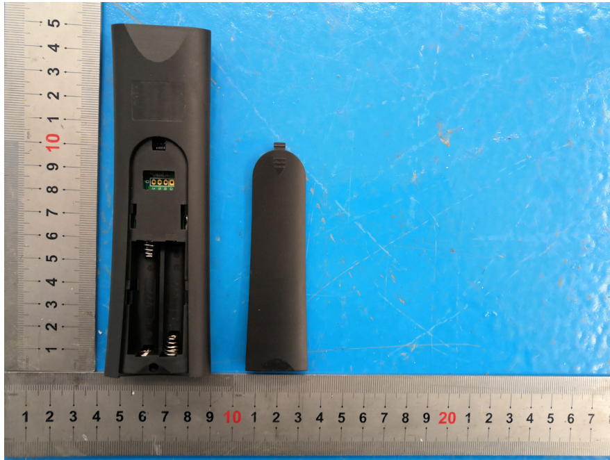
EUT – Cover off View-2