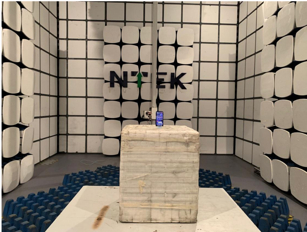
AC Conducted Measurement Photos