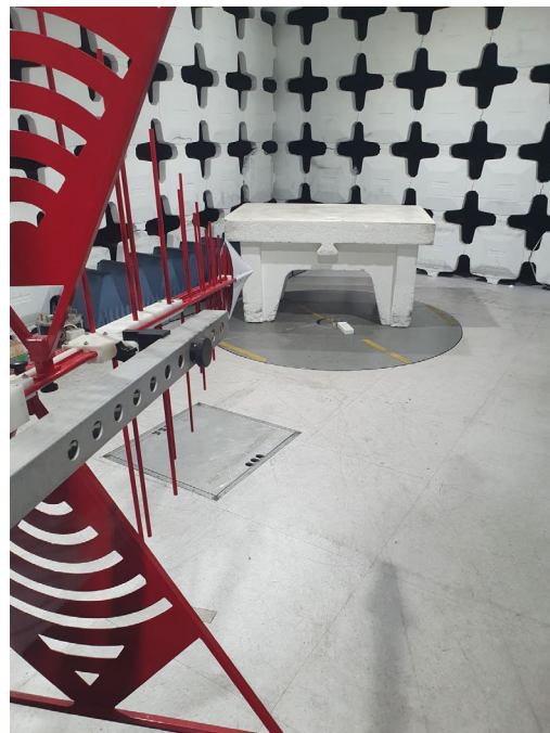
Radiated emissions test set up in 30MHz-1GHz frequency range