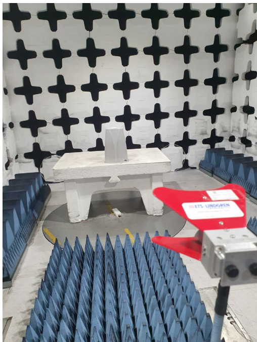
Radiated emissions test set up above 18GHz.