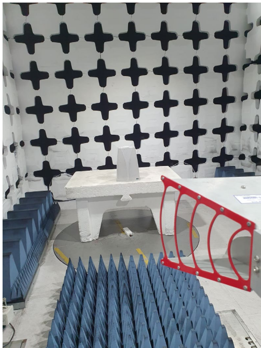
Radiated emissions test set up above 1GHz.