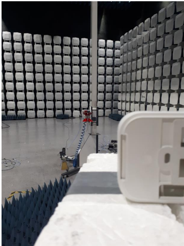
Radiated Emissions 2.5 – 9.5 GHz seen from device The EMCO 3117PA antenna is also used during IM-measurements up to 18 GHz