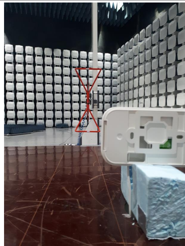
Radiated Emissions 30 – 1000 MHz seen from device