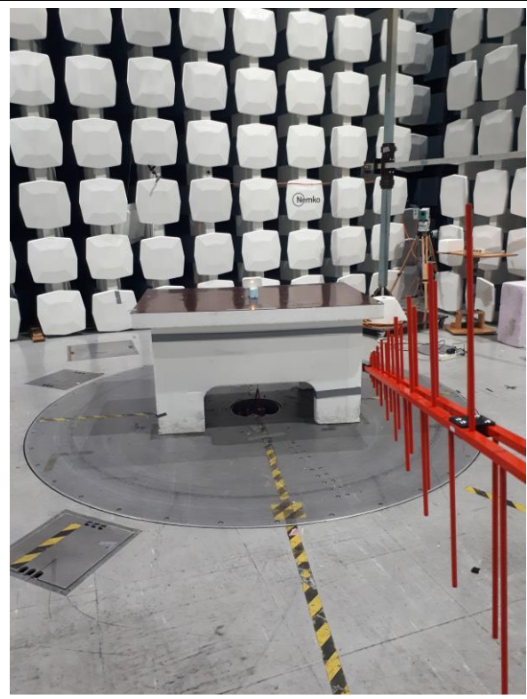
Radiated Emissions 30 – 1000 MHz seen from antenna