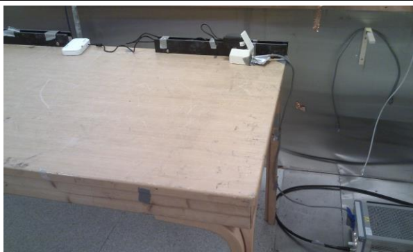
Power-Line Conducted Emissions