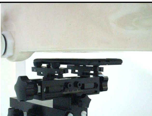
Rear Face of EUT with 1.0 cm Gap