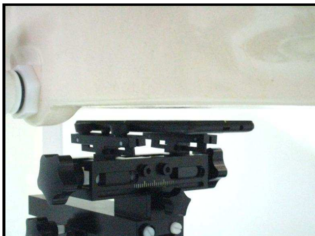
Front Face of EUT with 1.0 cm Gap