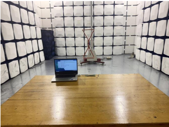
Radiated Spurious Emission Below 1GHz