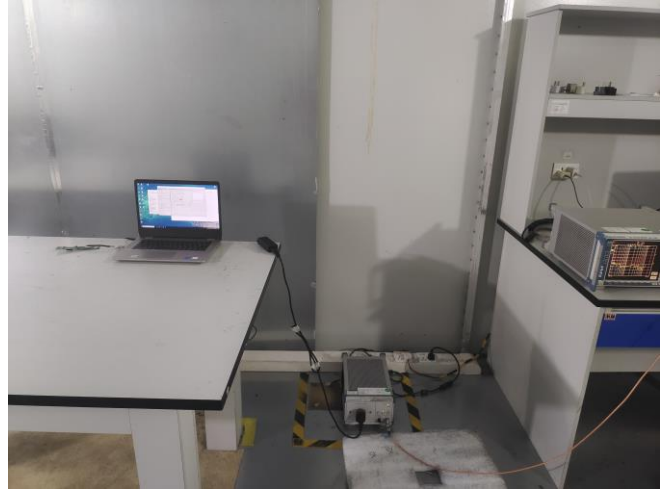
Conducted Emission on AC Mains