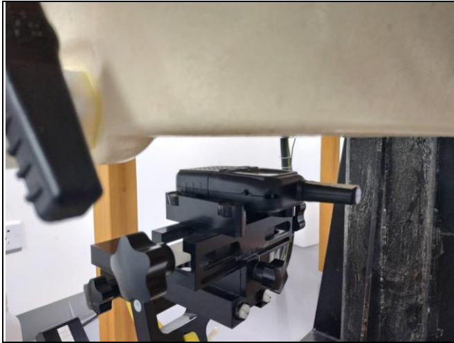
Front Face of EUT with 2.5 cm Gap