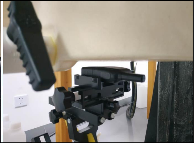
Rear Face of EUT with 1.0 cm Gap