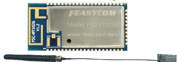
Figure 1: FSC-BT1026 picture