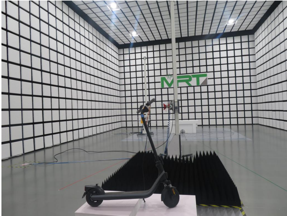
Description: Radiated Spurious Emission Test Setup for 18 ~ 40GHz