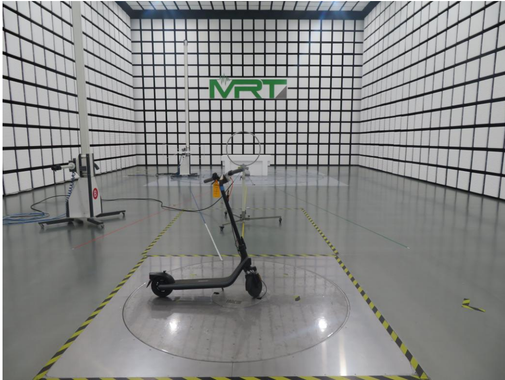
Description: Radiated Spurious Emission Test Setup for 30MHz ~ 1GHz