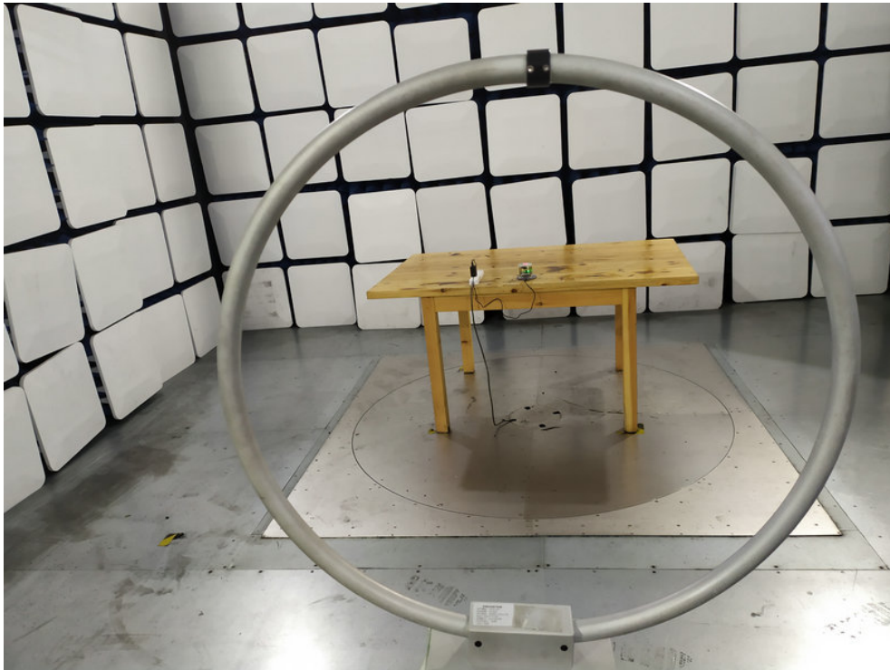
Photo of MPE Measurement