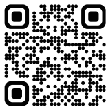
USER MANUAL NEUROGAIT APP/WEB