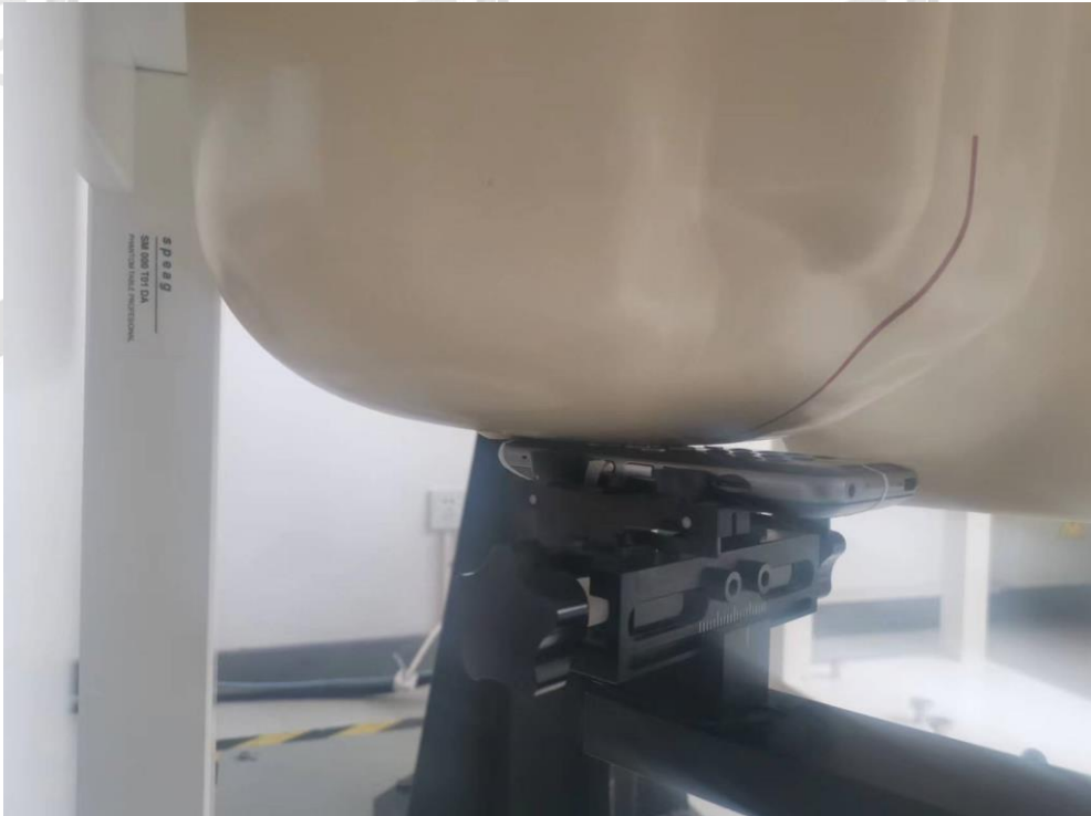
Right head cheek position