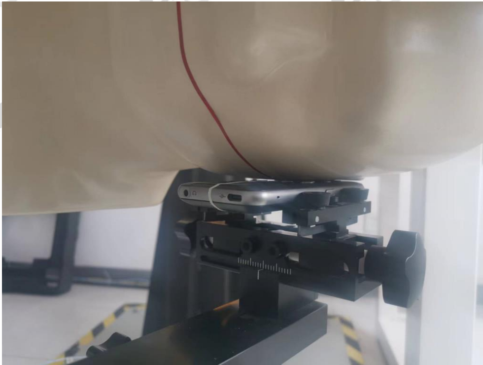
Left head cheek position