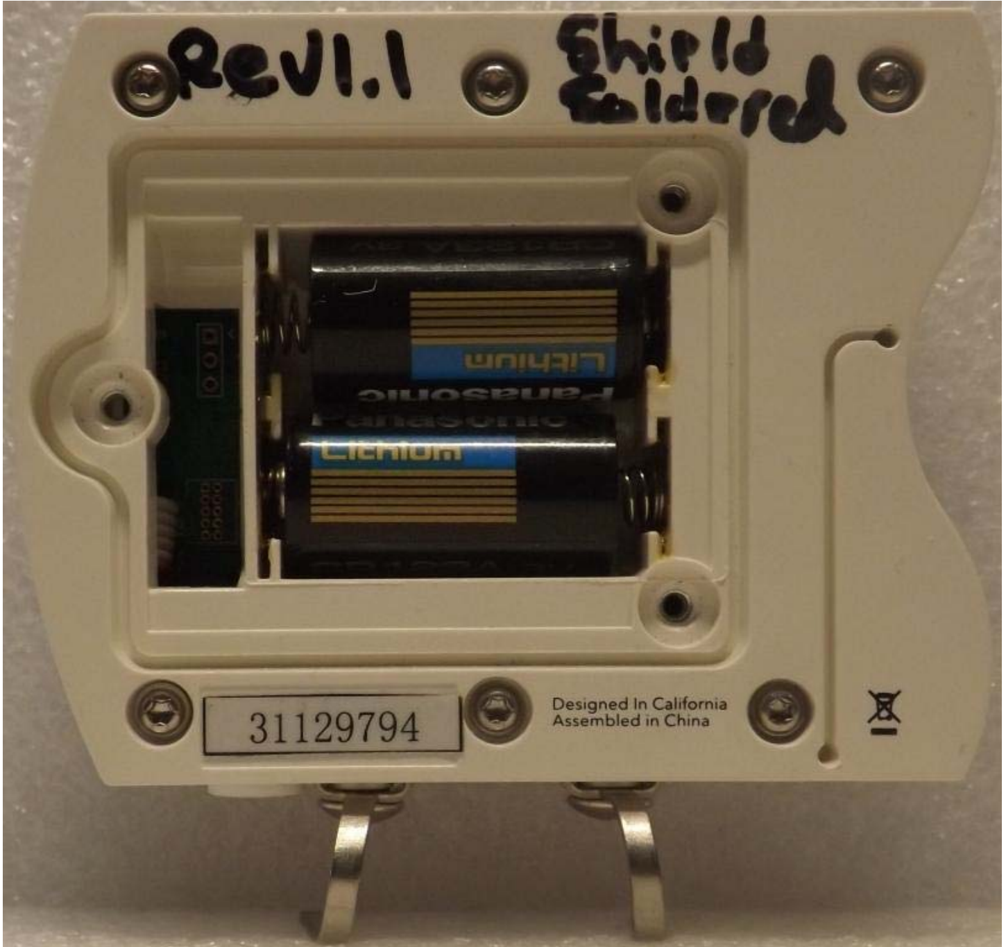
Figure E22.1 – Back, Battery Cover Removed