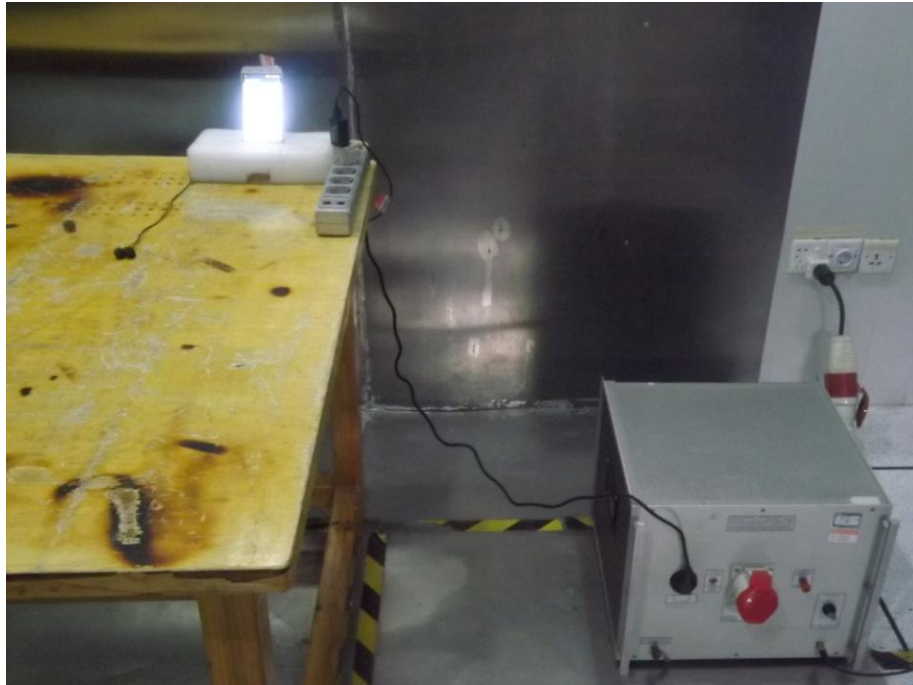
Test Site 1#

Photograph - Spurious Emissions Radiated Test Setup