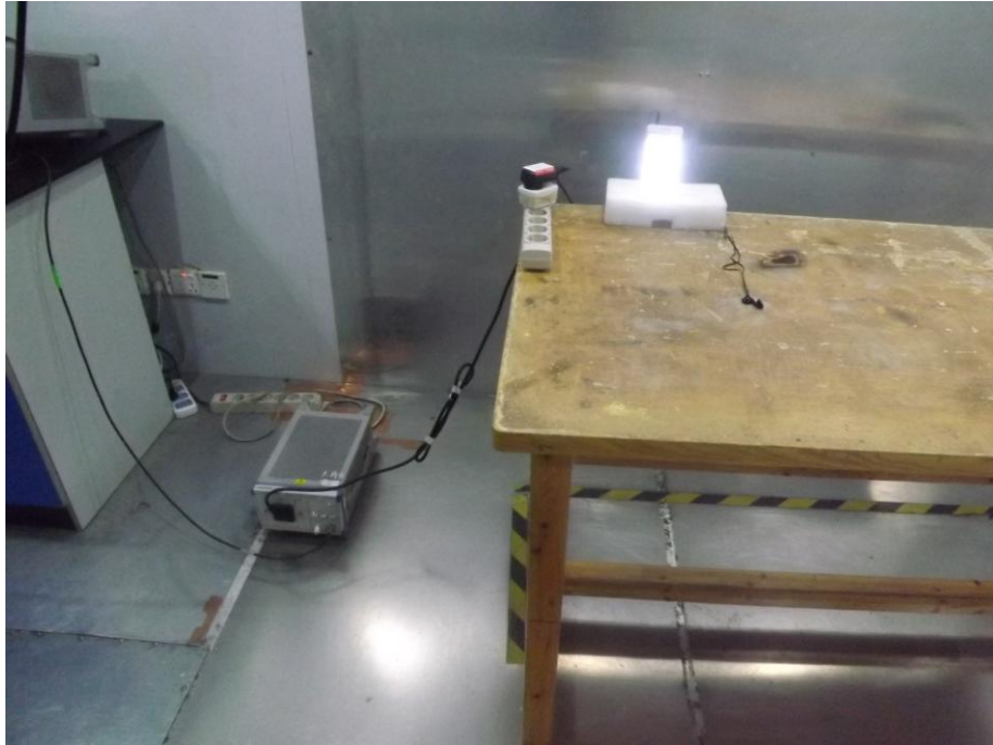
Test Site 1#