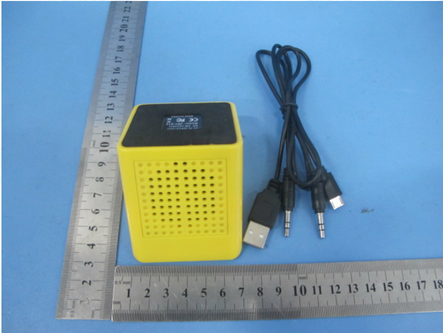
Photo 2 Appearance of EUT