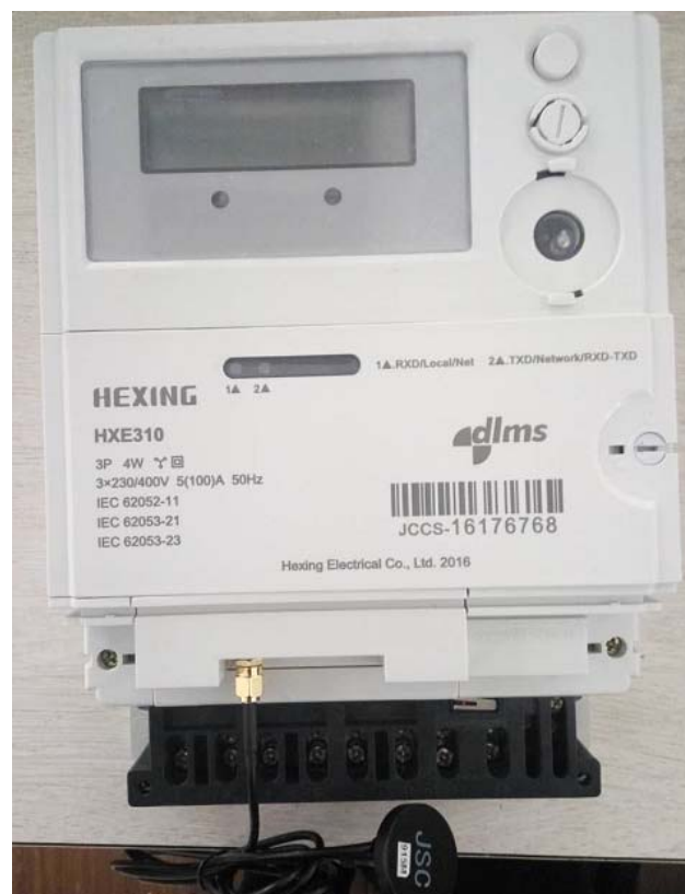
Installed in the sample