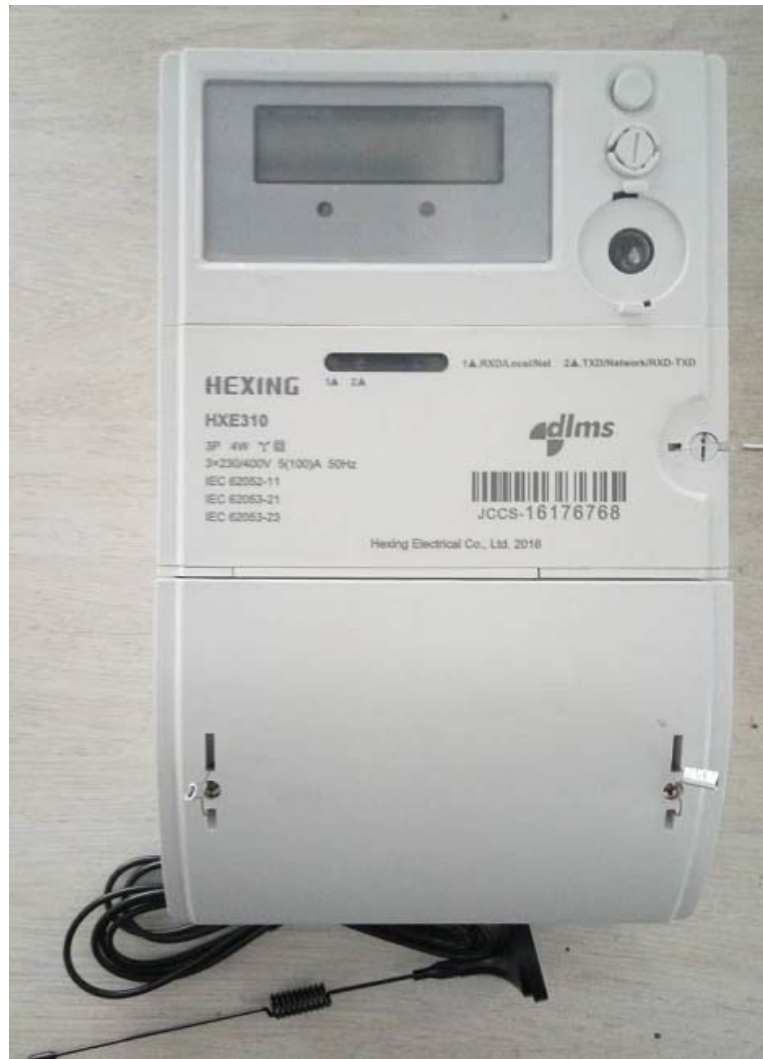
Installed in the sample

Electric meter models only for reference.