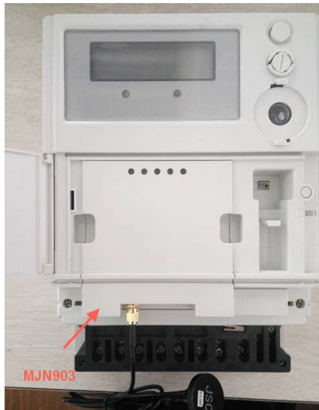
Installed in the sample