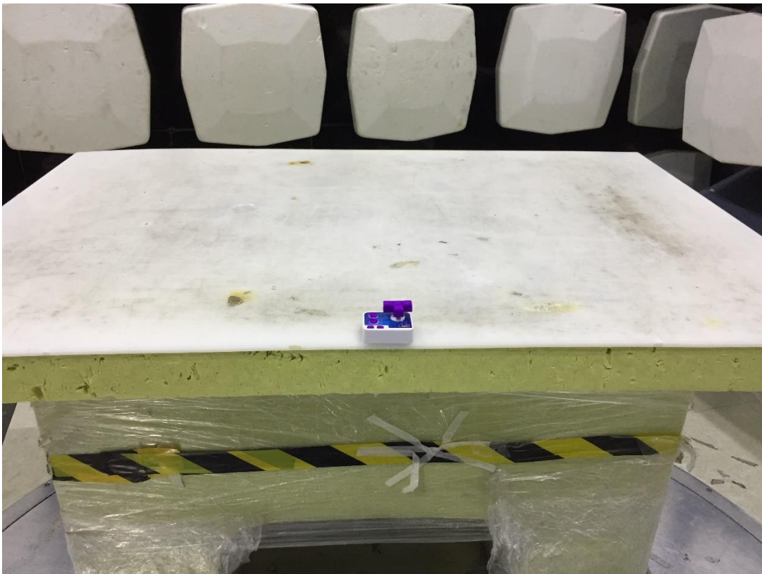
Up to 1GHz (The EUT placed at the center of the turntable)