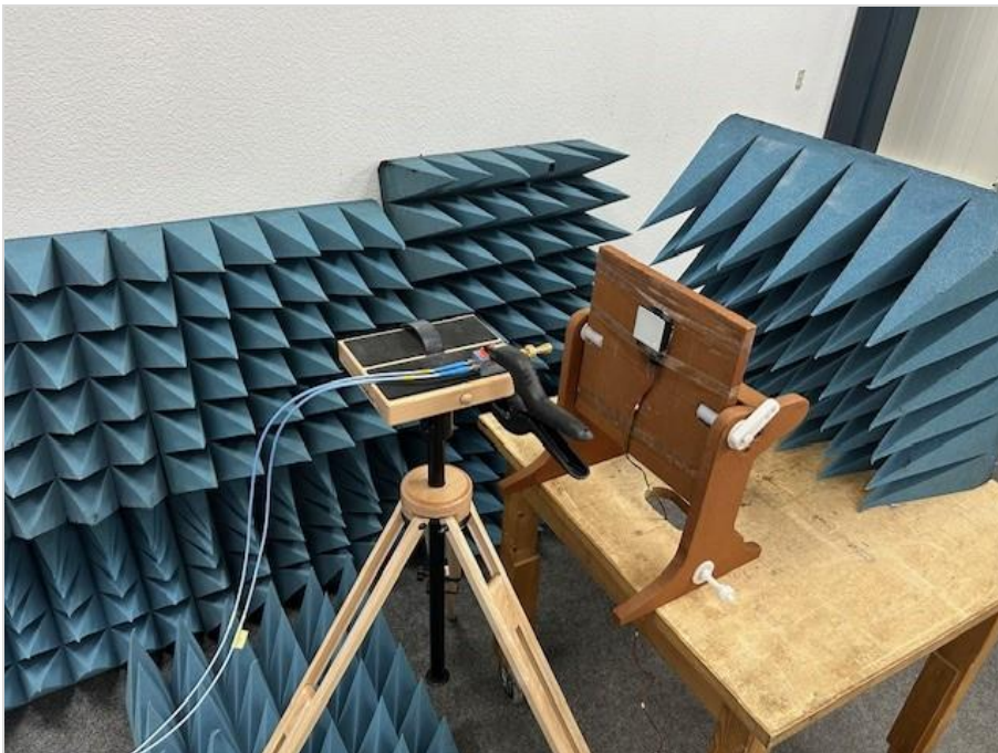
Photograph 2: EUT test setup in the RC8G Lab