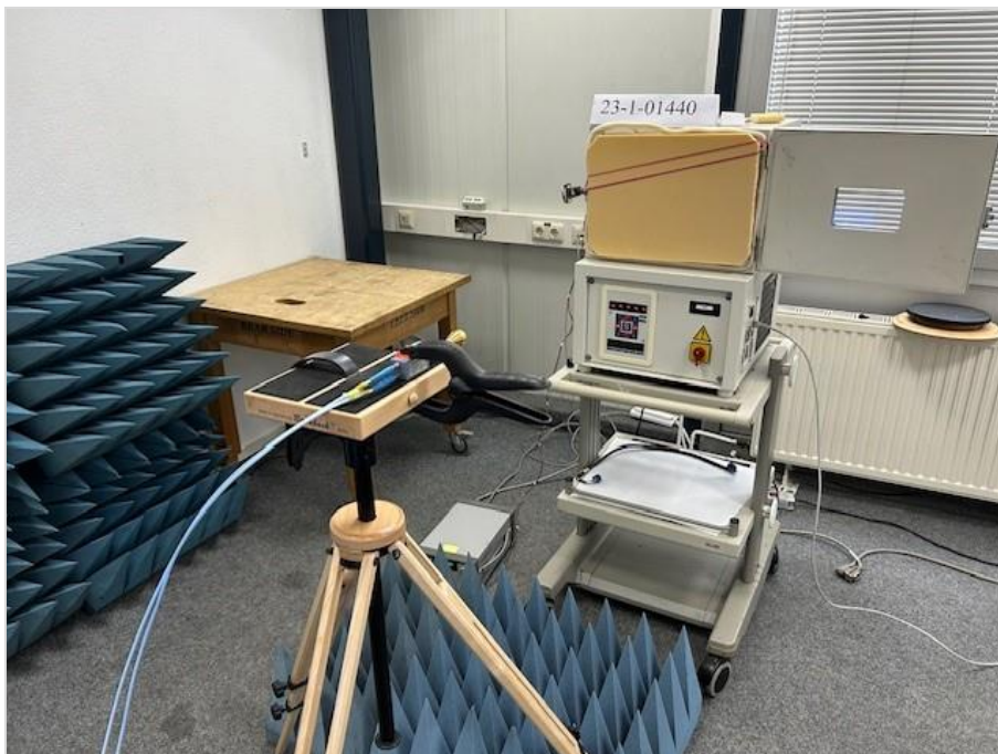
Photograph 4: EUT test setup in RC8G Lab during Extreme Condition measurements