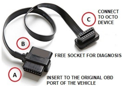
SPLITTER M/F CABLE