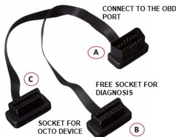
SPLITTER "Y" CABLE