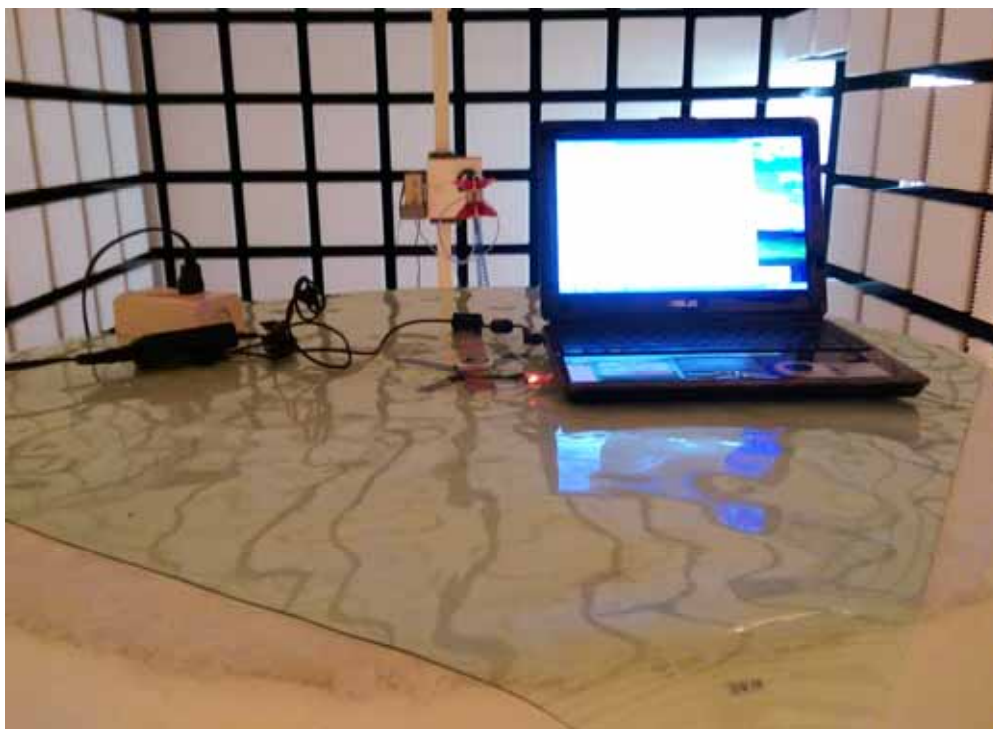
EUT on Lie