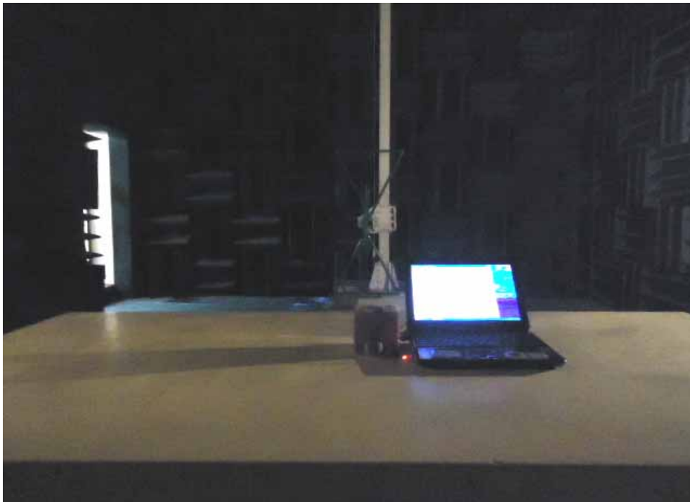
Frequency Above 1GHz