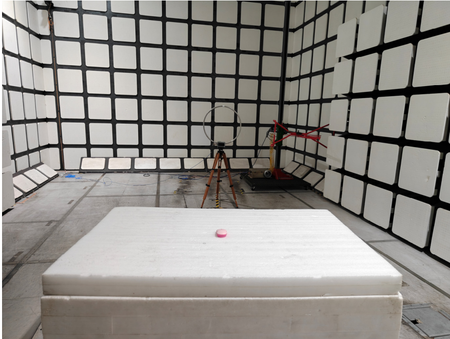
Radiated Emissions View (30 MHz- 1 GHz)