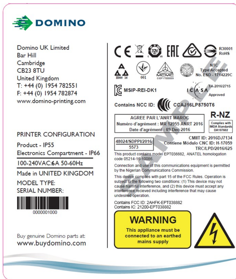
Figure 3 – Example Host Label for a Domino Printers

Below is an example of the printer (host product) label containing the statement above.