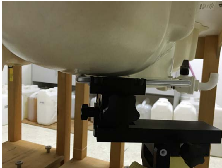
Right Head Cheek Setup Photo