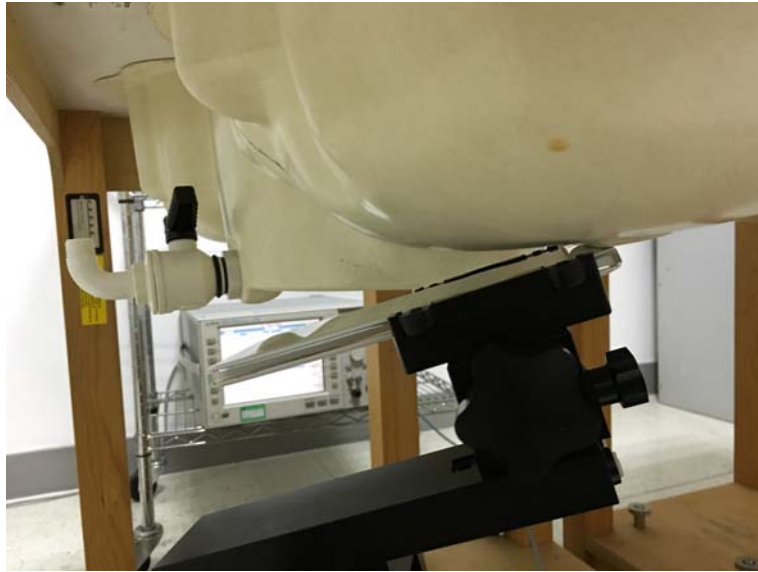
Left Head Tilt Setup Photo