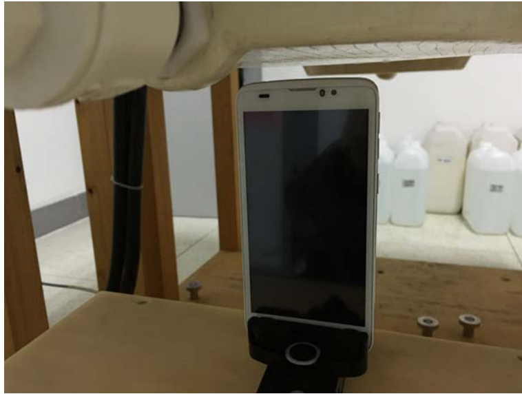
10mm Top Side Setup Photo