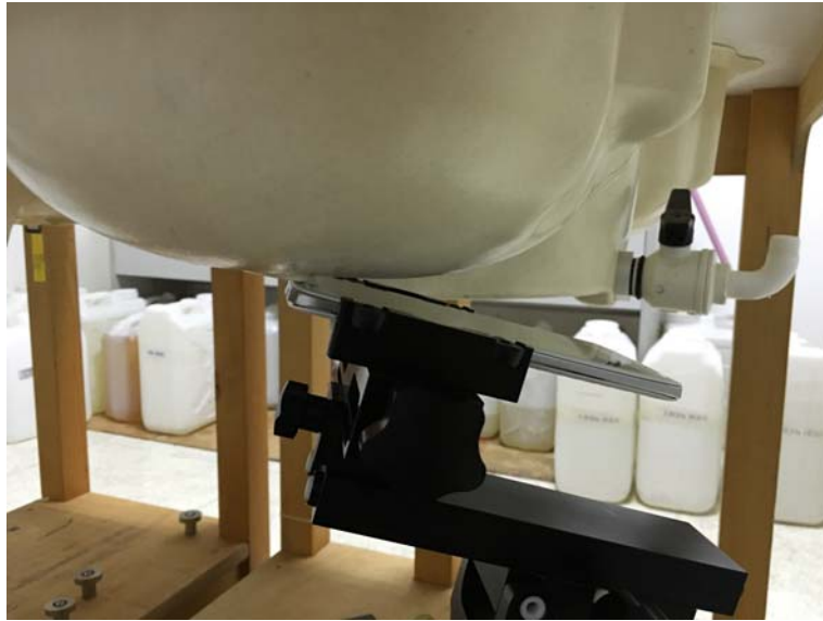
Right Head Tilt Setup Photo