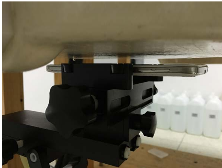
10mm Front Side Setup Photo