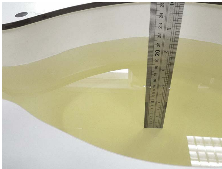
Photograph of the depth in the Body Phantom