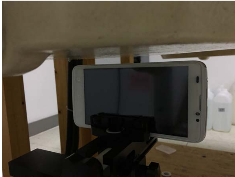
10mm Left Side Setup Photo