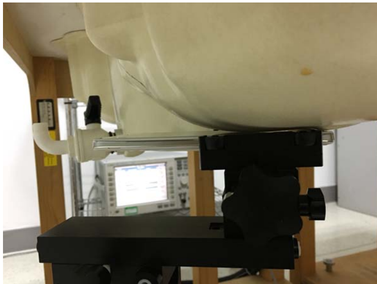
Left Head Cheek Setup Photo