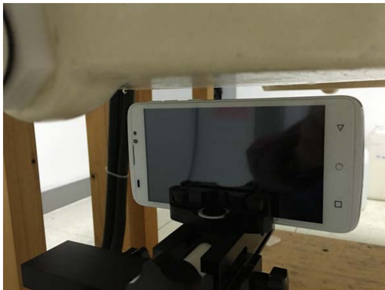
10mm Right Side Setup Photo