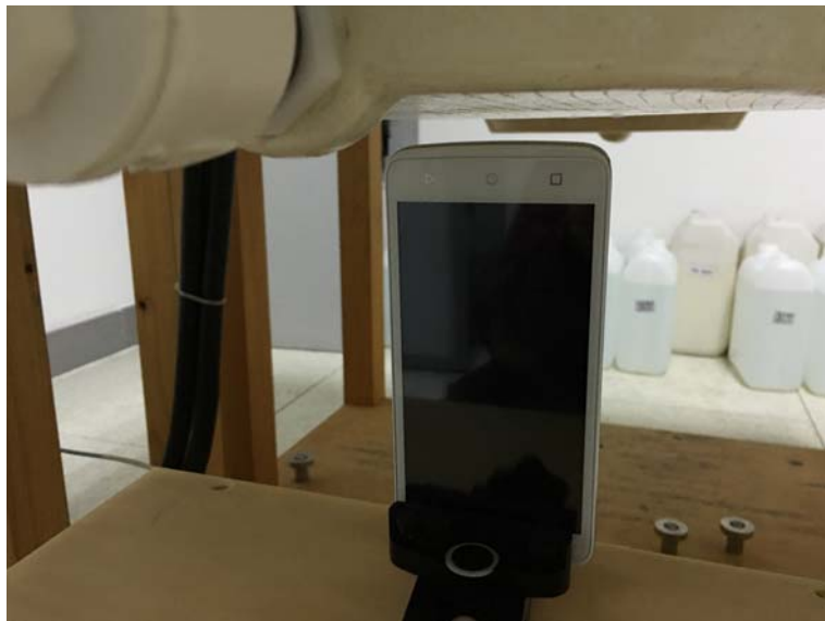
10mm Bottom Side Setup Photo