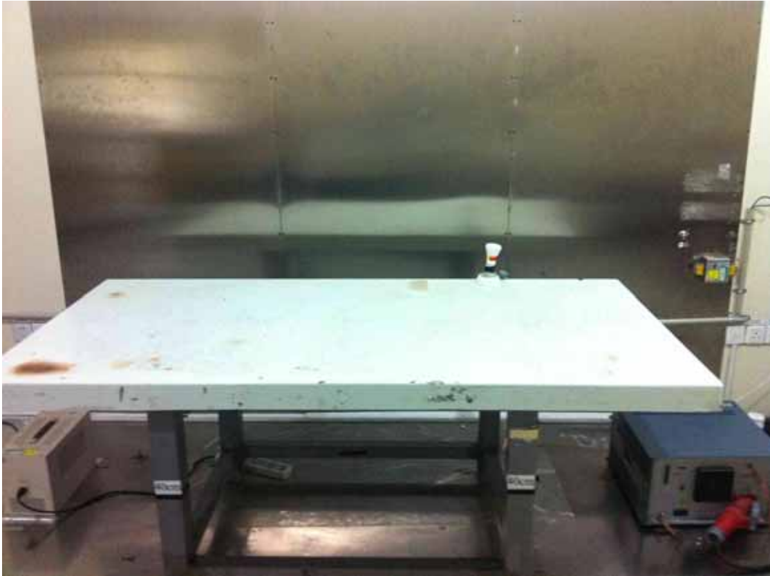
Front View of Conducted Disturbance Measurement