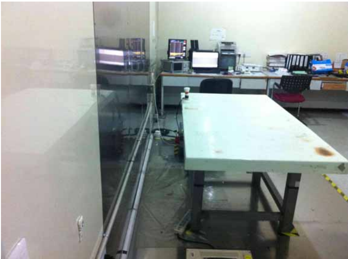
Side View of Conducted Disturbance Measurement