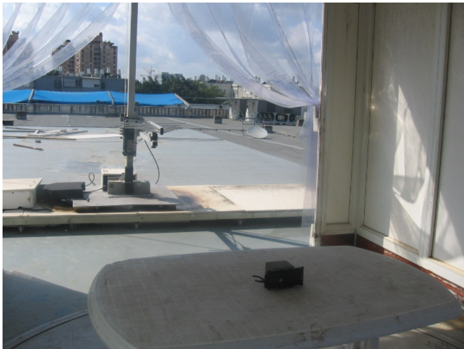
Radiated Emission Test, 200-1000MHz