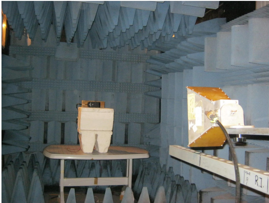
Radiated Emission Test, 1-18GHz and Intermodulated Radiated Emission Test