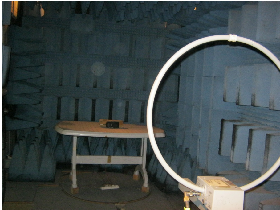
Radiated Emission Test, 0.009-30MHz