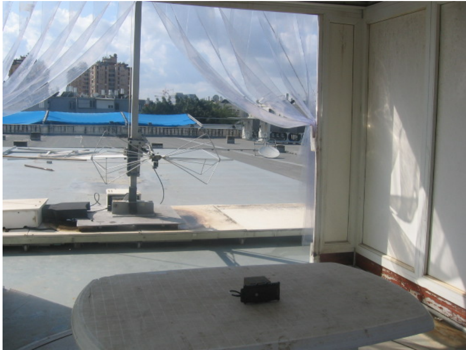
Radiated Emission Test, 30-200MHz