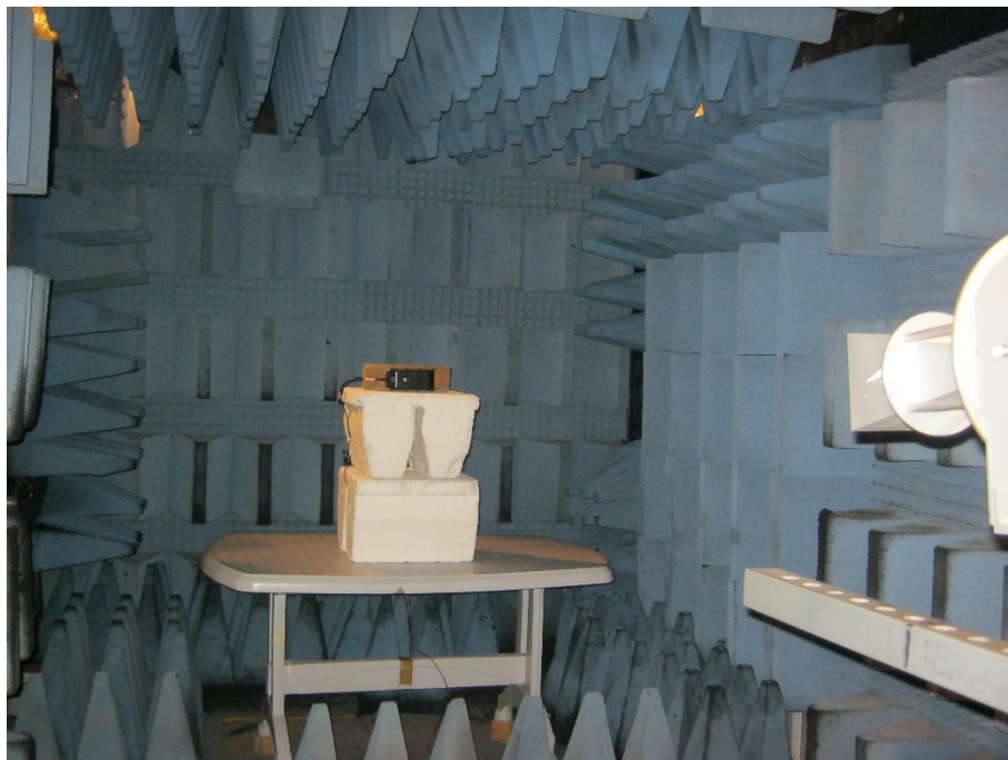
Radiated Emission Test, 18-26.5GHz