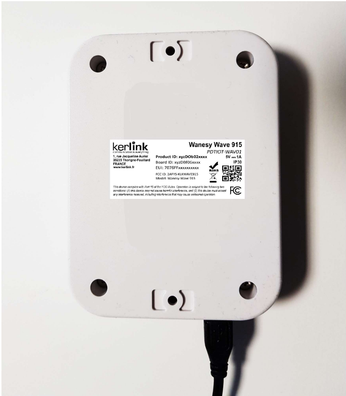
General view of the Wanesy Wave 915