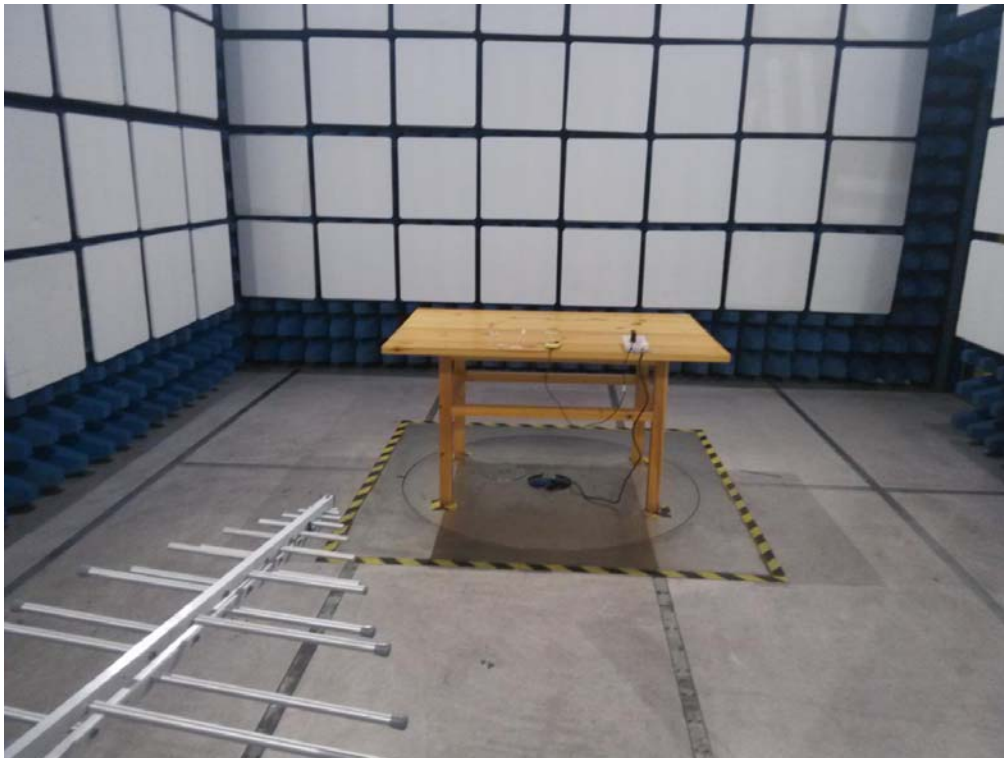
30 MHz-1 GHz