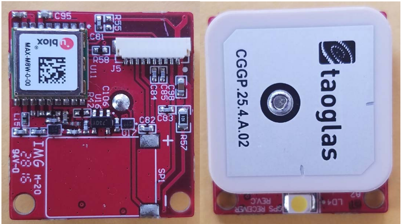
Figure 3 - Specifi-Kali Dog Tracking System - GPS PWB – Top & Bottom