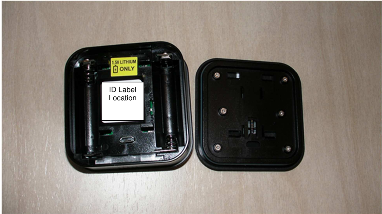
ID Label Location