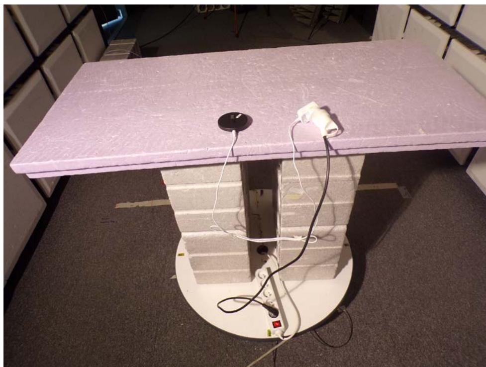
Radiated emission below 1GHz