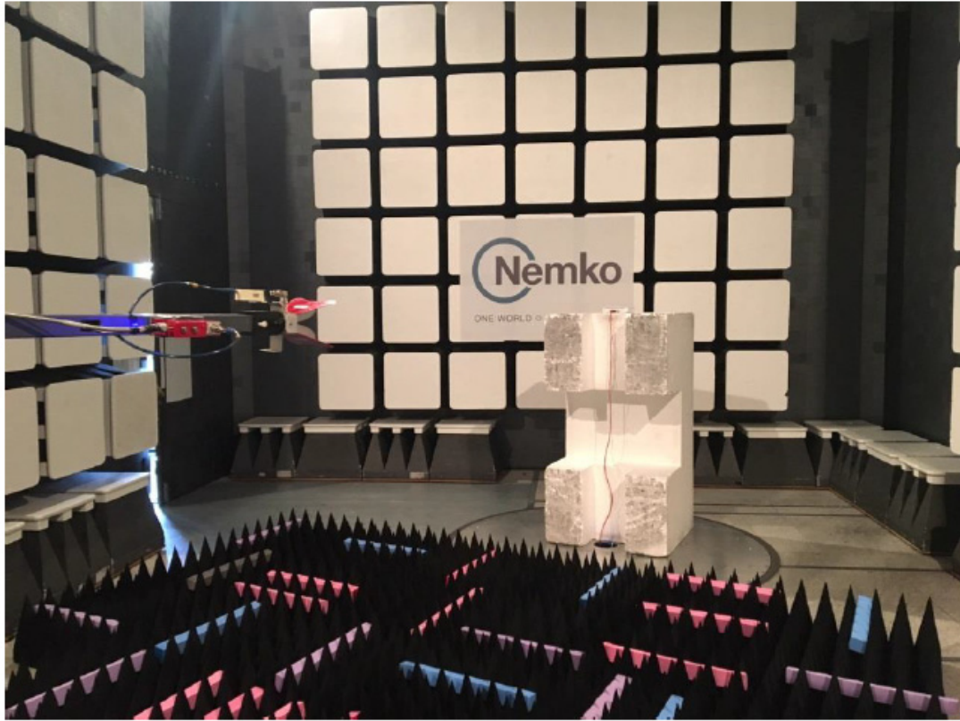
Figure 8.1-18: Radiated – Undesirable (unwanted) emissions setup photo – above 1 GHz