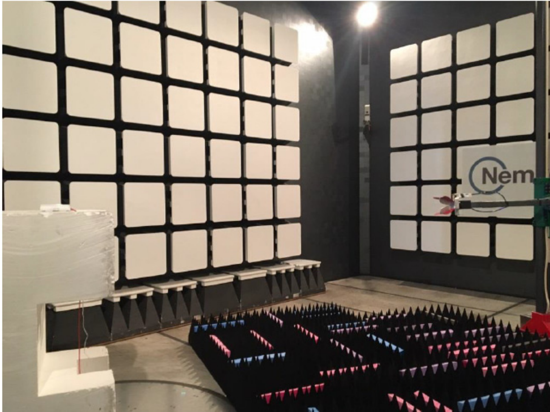
Figure 8.1-17: Radiated – Undesirable (unwanted) emissions setup photo – above 1 GHz