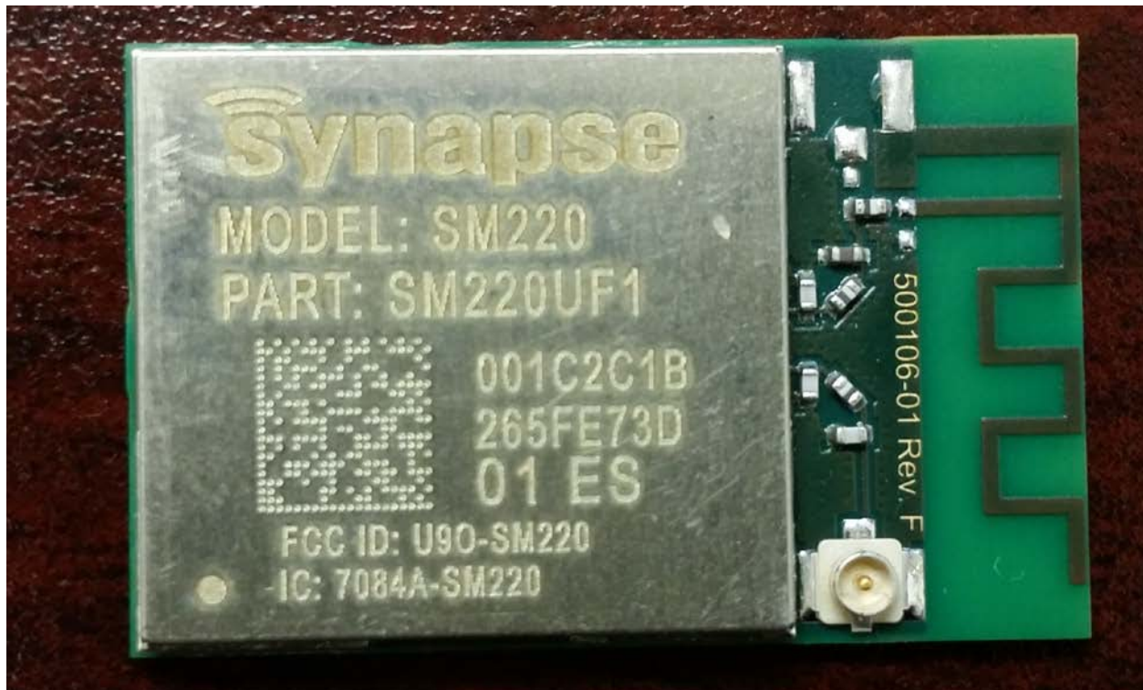
Figure 1: Top View