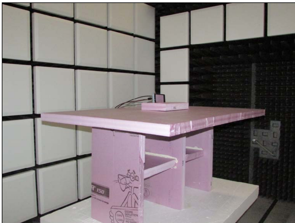
Figure 1: Front View – Above 1 GHz