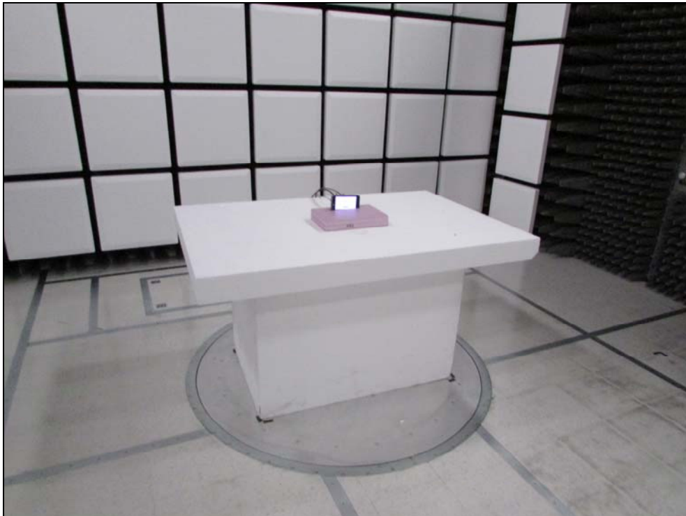
Figure 3: Front View – Below 1 GHz