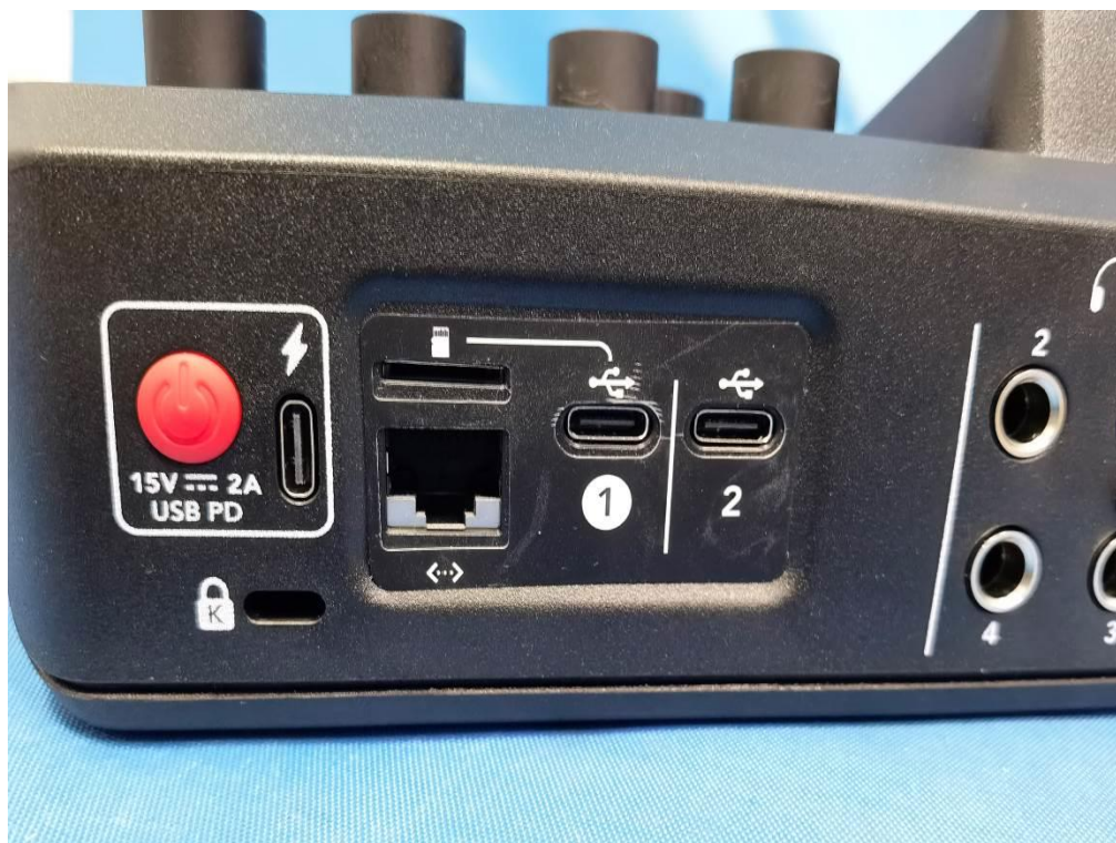
PORT VIEW-2 OF EUT