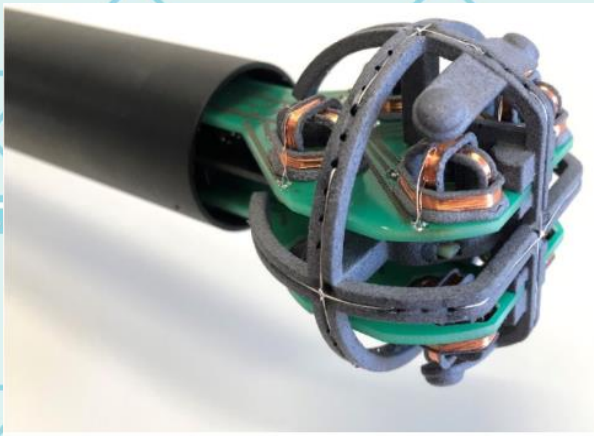
Table 2:MAGPy-8H3D+E3D V2 probe specifications