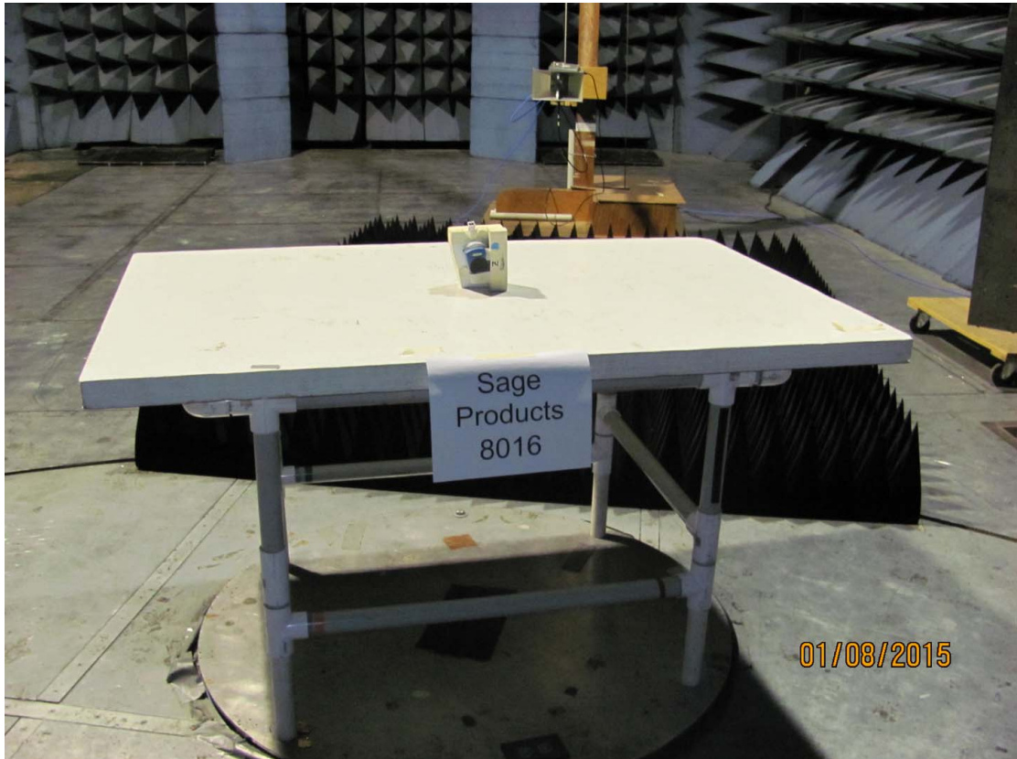
The EUT was taped to a foam stand in order to change the axis of rotation.