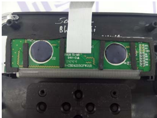
PCB 3 view

Copyright of this report is owned by Centre of Testing Service and may not be reproduced other than in full except with the written approval of the issuing Company.