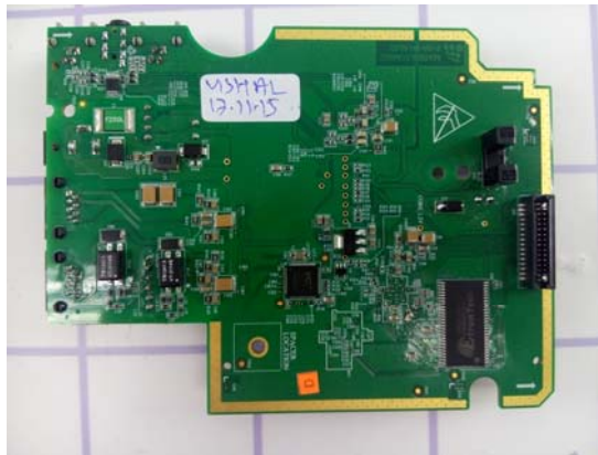
PCB 1 side 1 view