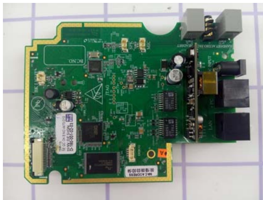
PCB 1 side 2 view

Copyright of this report is owned by Centre of Testing Service and may not be reproduced other than in full except with the written approval of the issuing Company.