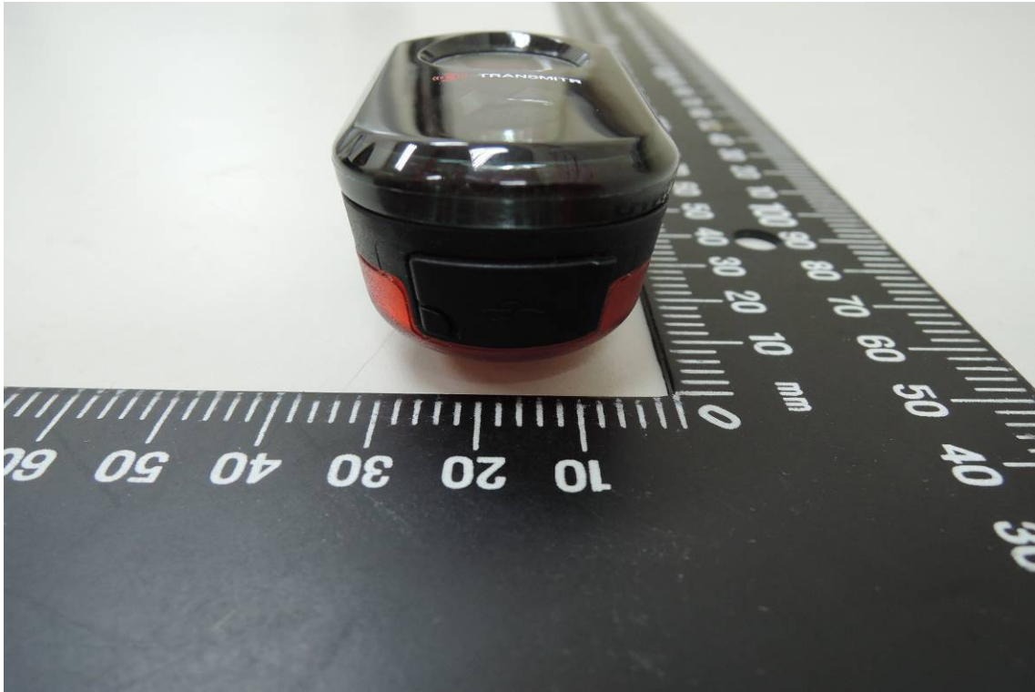
Battery – S/N: C05367