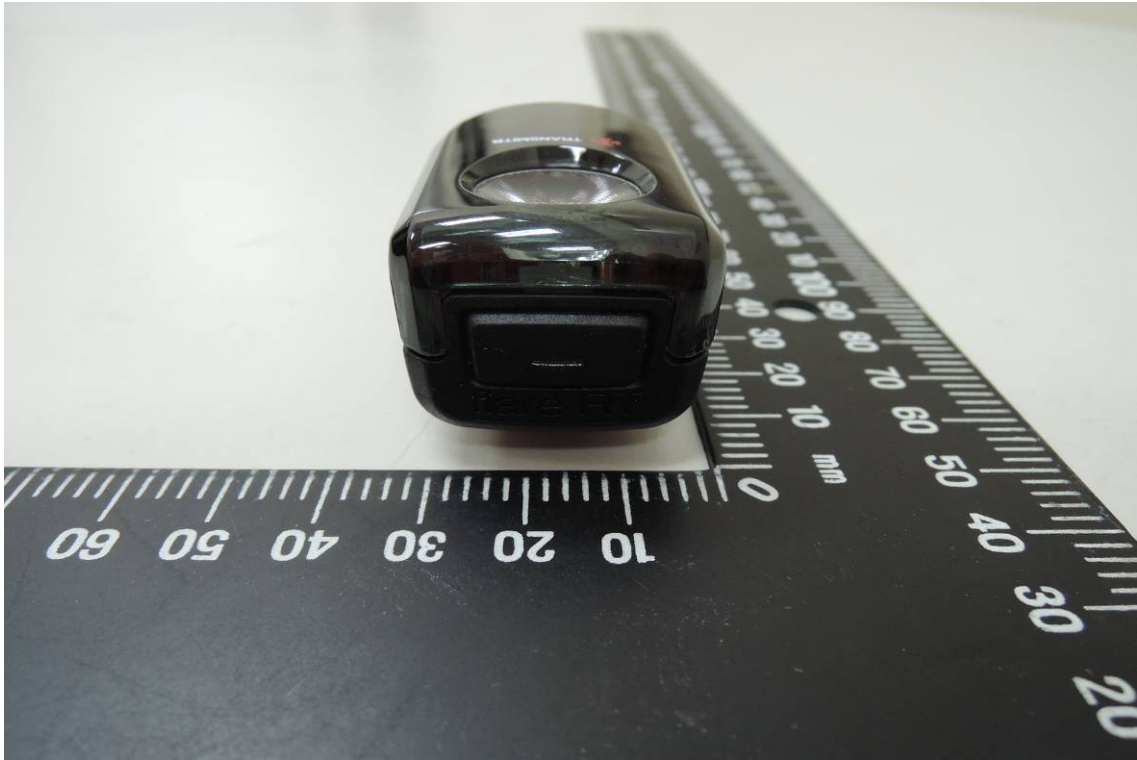
Side View of EUT – 3