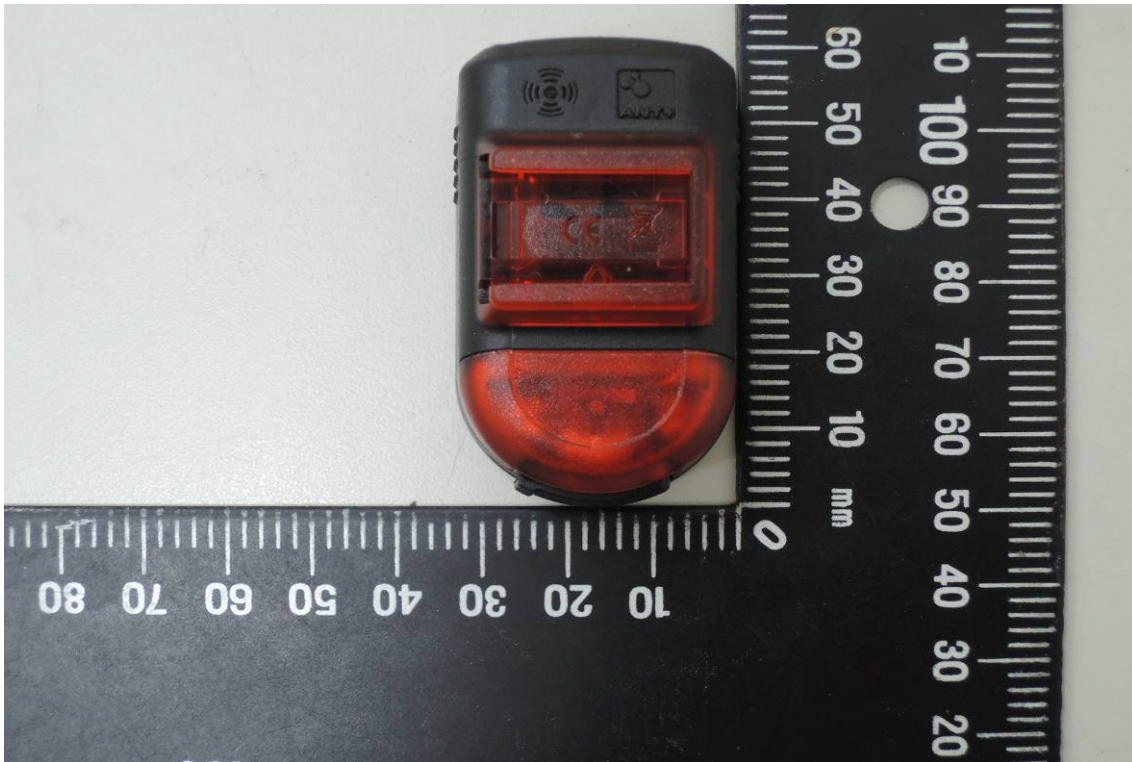
Side View of EUT - 1