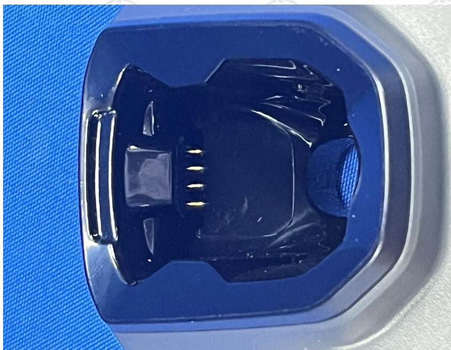
View of Product-08