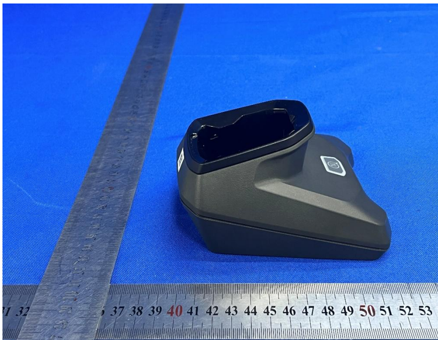
View of Product-05