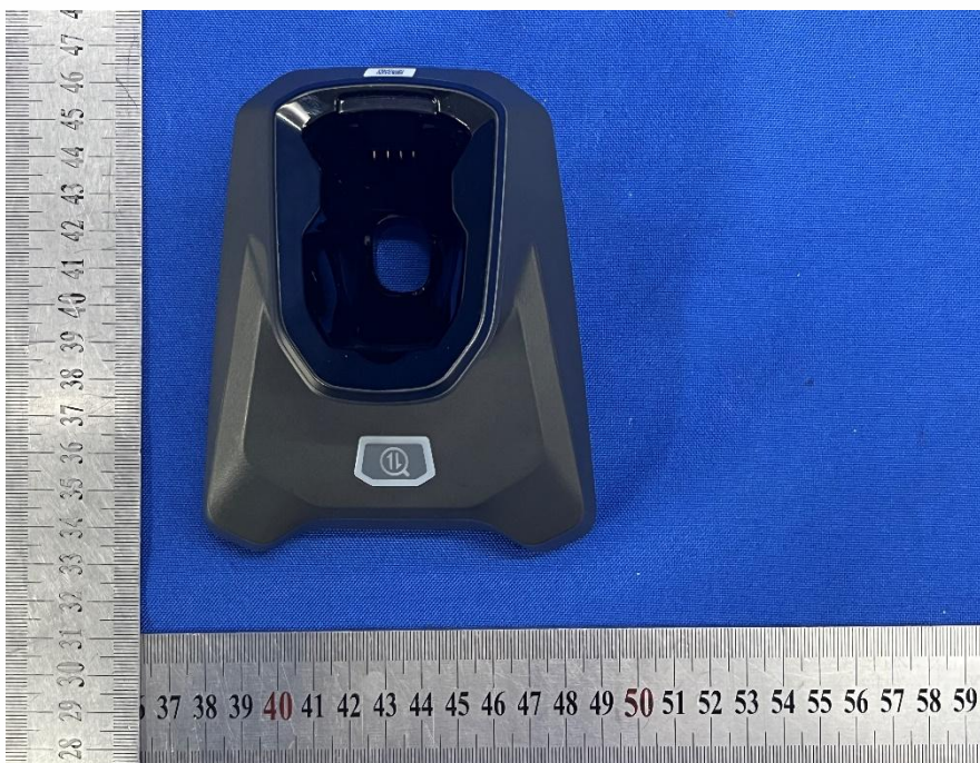
View of Product-02