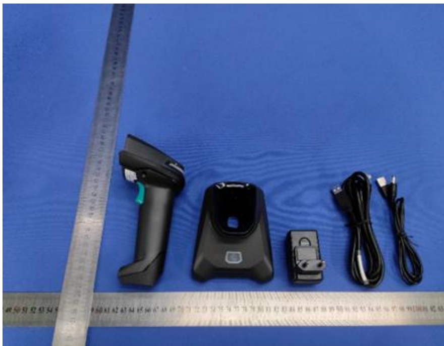
View of Product-01