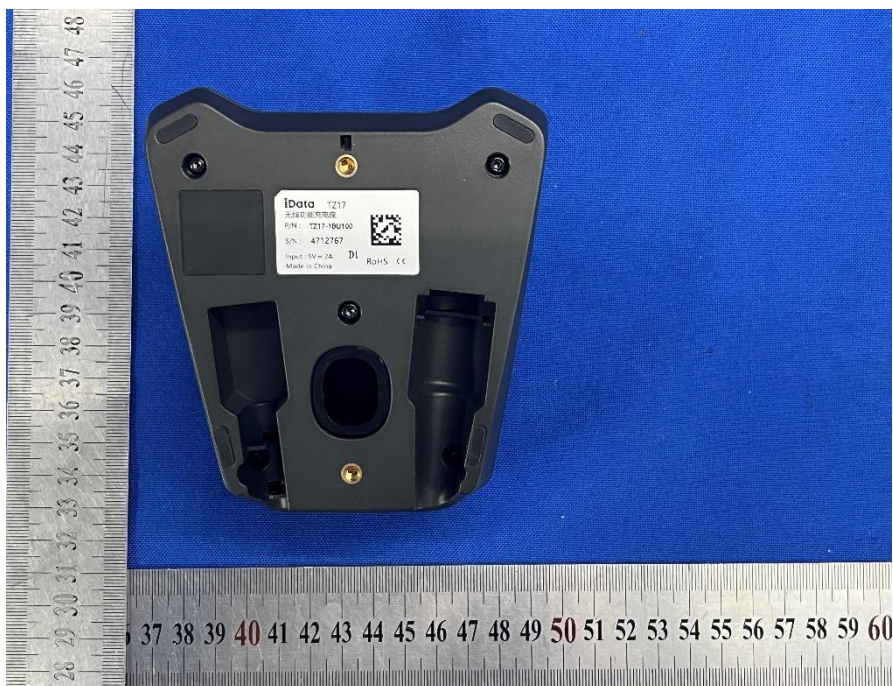
View of Product-03