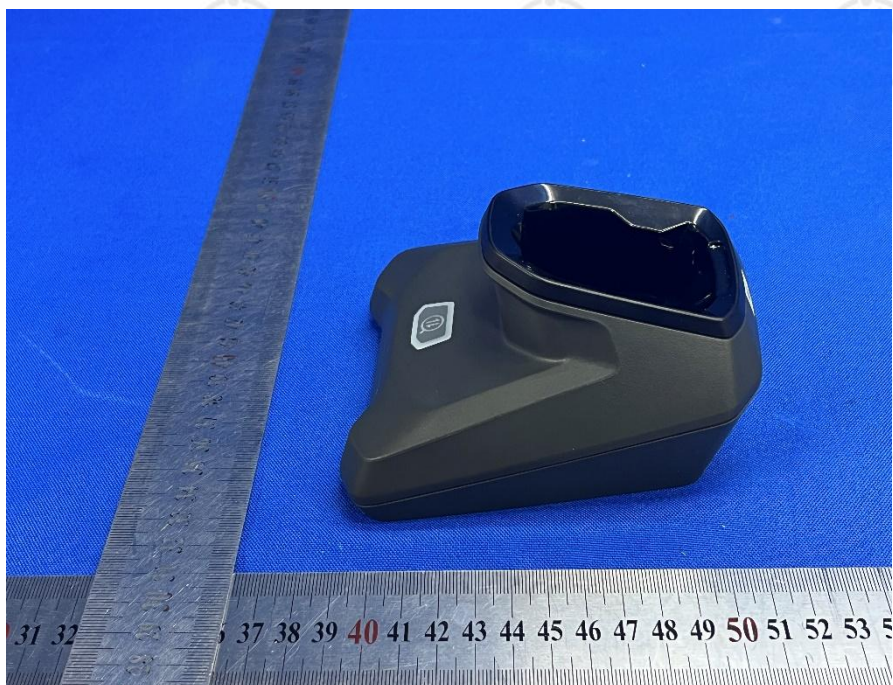
View of Product-04