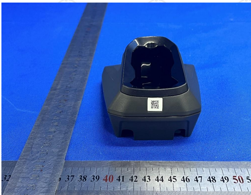
View of Product-06