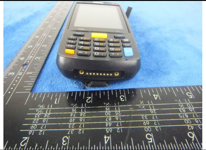
EUT - Bottom View