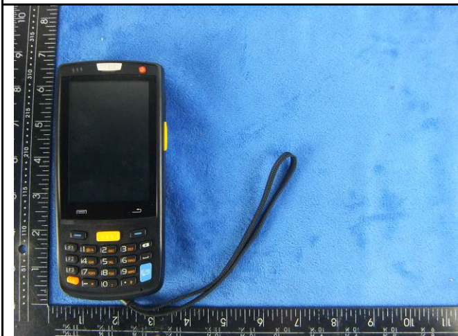
EUT - Front View