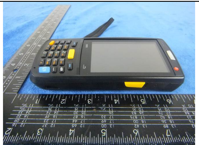
EUT - Right View