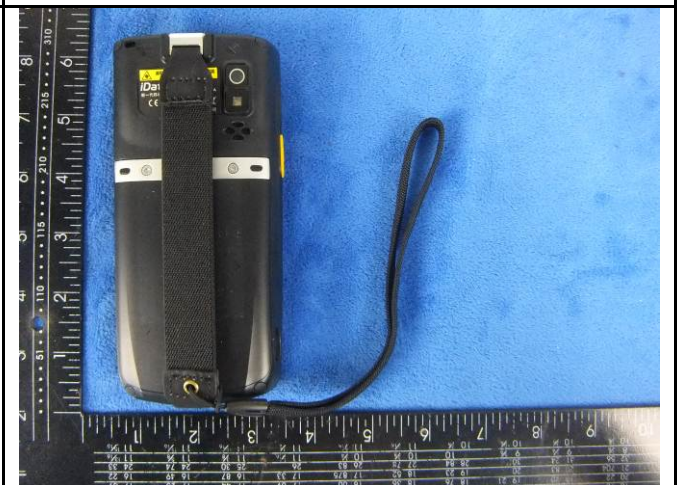
EUT - Rear View