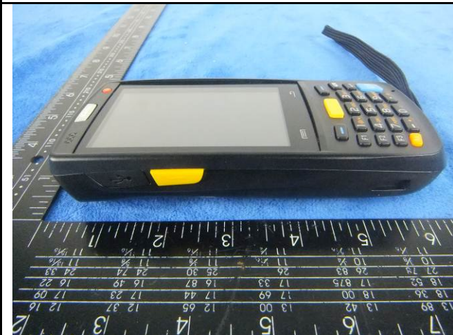
EUT - Left View