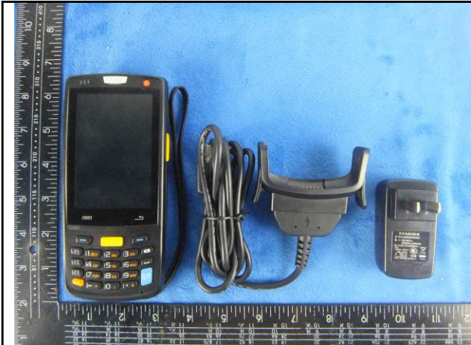
Whole Package - Top View