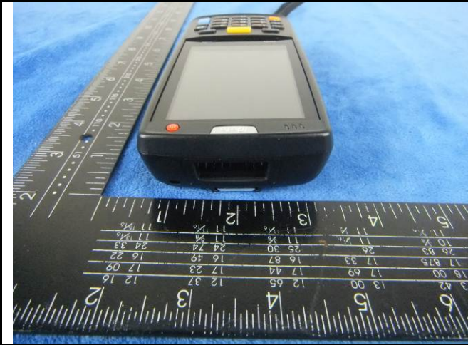
EUT - Top View