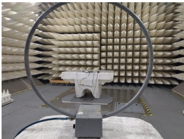
Photograph No.1 Spurious emissions measurement setup in the anechoic chamber below 30 MHz