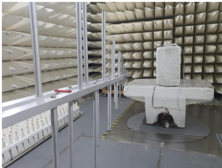
Photograph No.3 Spurious emissions measurement setup in the anechoic chamber in 1 -18 GHz