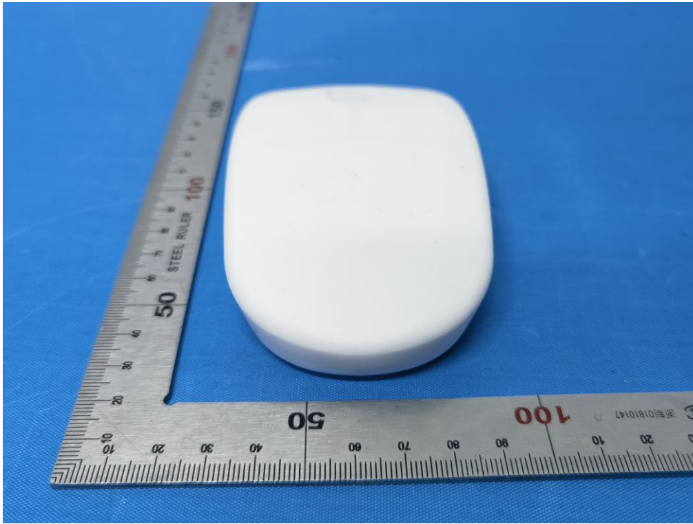
LEFT VIEW OF EUT (Touch-Scroll)