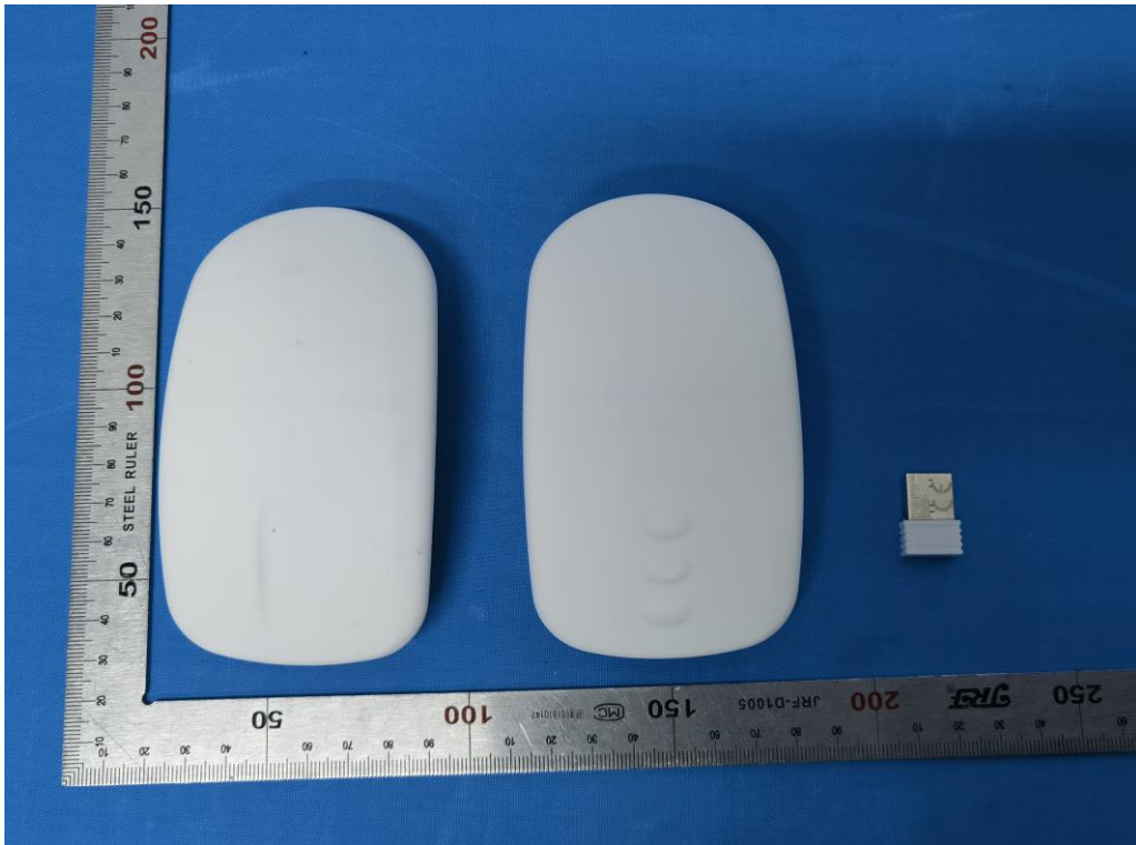
TOP VIEW OF EUT (Touch-Scroll)