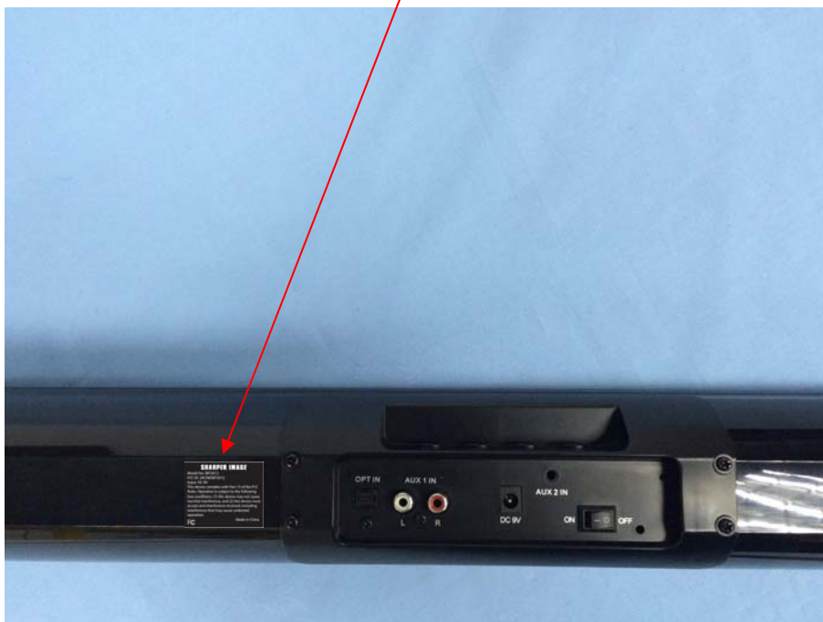
FCC ID Label Location