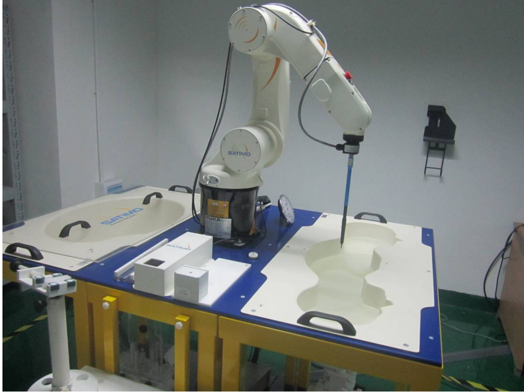
Liquid depth \geq 15\text{cm}