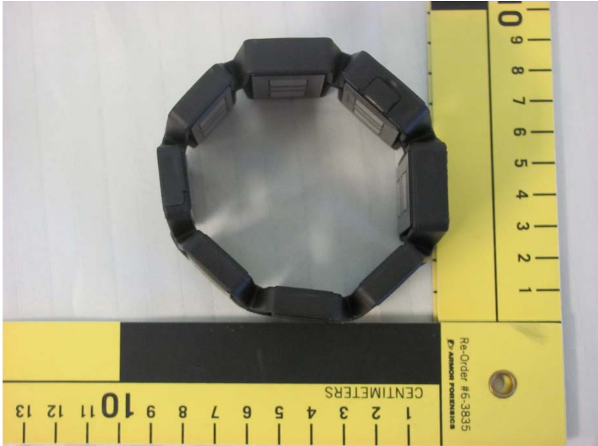
Illustration 1: EUT external top view