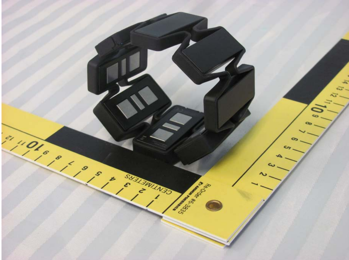
Illustration 2: EUT external side view