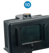
Back, with LED display visible