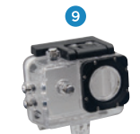
Use the Waterproof case or the Screw Adapter and Product Mount to connect the Camera to the Helmet Base.