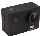
1080p High Definition Action Camera