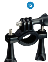
Use the Bicycle or Pole Mount and screw together either the grooves from the Waterproof case or from the Screw Adapter.