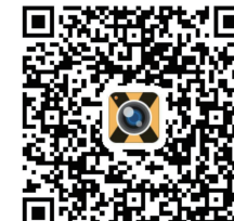
QR CODE For ANDROID smart phone