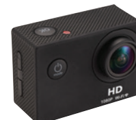
Insert the Camera into the Waterproof case or the Product Mount.