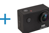
Insert the Camera into the Waterproof case or the Product Mount.