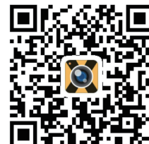
QR CODE for IOS smart phone