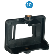
Attach the Camera to the Product Mount so the LED screen pokes through the cut out.