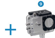
Use the Waterproof case or the Screw Adapter and Product Mount to connect the Camera to the Helmet Base.