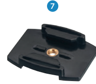
Use the Helmet base to create a stationary platform to insert the Connection Mount.