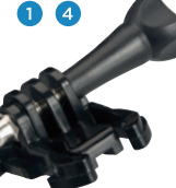
Screw these two pieces together to create the connection for mounting.