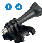
Screw these two pieces together to create the connection for mounting.