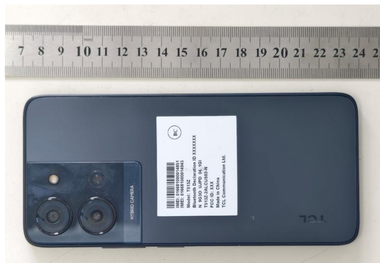
Pic 2 Mobile Phone