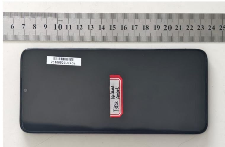
Pic 1 Mobile Phone